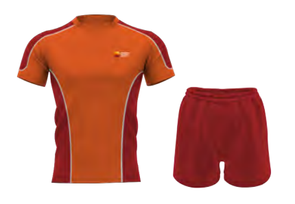
Pre-KG to Grade 5