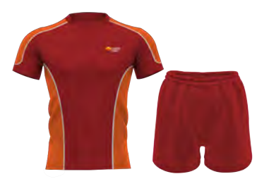
Grades 6 to 12